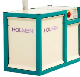
In-line / Automatic Feed & Wood Pellets