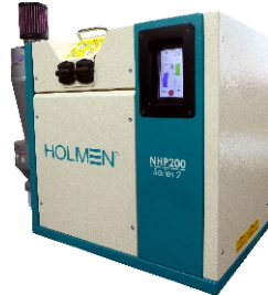
Desktop / Automatic Feed & Wood Pellets