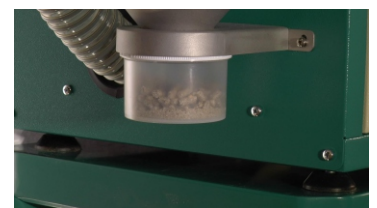
Standard discharge container