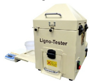
Portable / Manual Wood Pellets