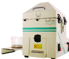
Portable / Manual Feed Pellets