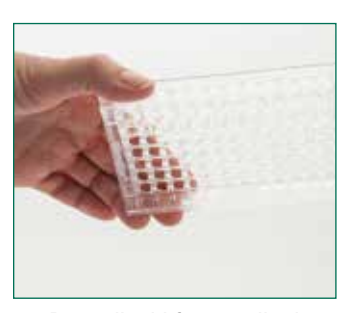
3. Dump liquid from antibody wells.