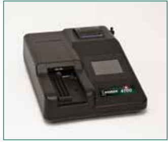
10. Read results in a microwell reader.