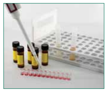
1. Add 150 µL controls and extracted samples to transfer wells.