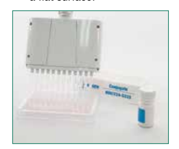
6. Transfer 100 µL conjugate from reagent boat to antibody wells using 12-channel pipettor. Incubate for 10 minutes. Mix for 20 seconds by sliding back and forth on a flat surface.