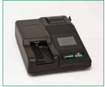
10. Read results in a microwell reader.