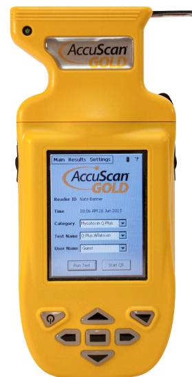
Neogen item 9595