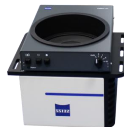
Figure 1: Laboratory configuration with Turnstep Module