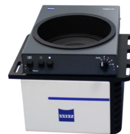
Figure 1: Laboratory configuration with Turnstep Module