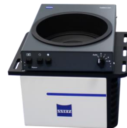
Figure 1: Laboratory configuration with Turnstep Module