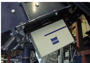
Figure2: On-Line configuration on a chain conveyor

Corona extreme and InProcess® software is the spectrometer system designed to increase productivity in your production process. The system is able to operate under extreme conditions.